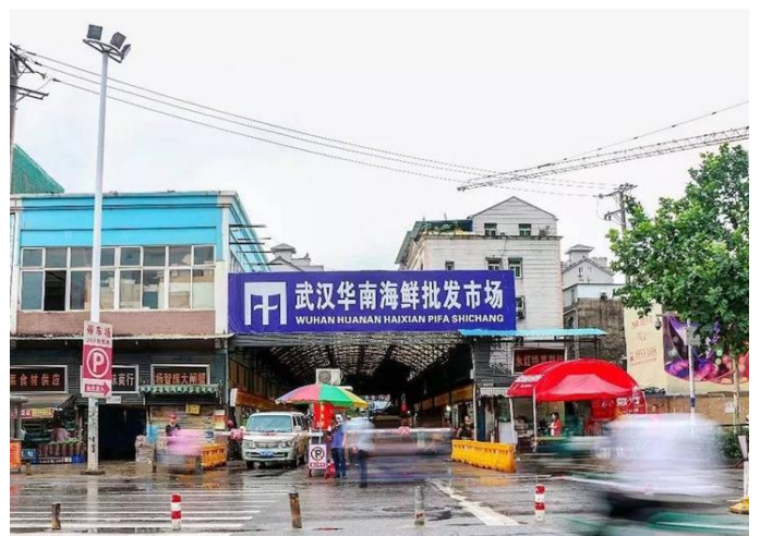
Fig. 3. Potential source of COVID-19