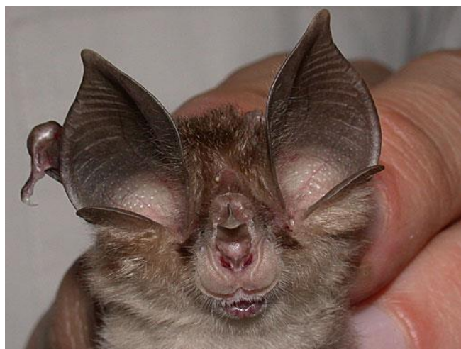
Fig. 2. Rhinolophus siamensis